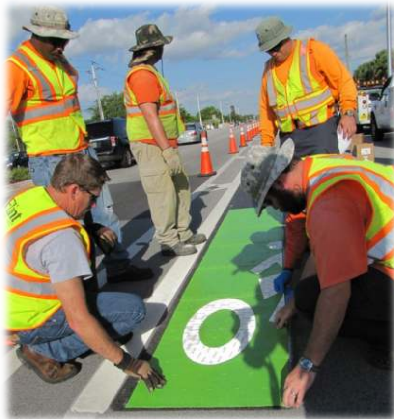
Installation of a green bicycle lane on Bailey Road, another Broward Complete Streets project.

POLICY T1.1.7 Broward County shall support and incorporate into the County’s codes and standards the context sensitive use of “street/traffic calming” techniques (e.g. reduced vehicle lane width), textured pavement, chicanes, roundabouts, on-street parking, strategic use of differing median types) to enhance multi-modal user safety and accessibility.