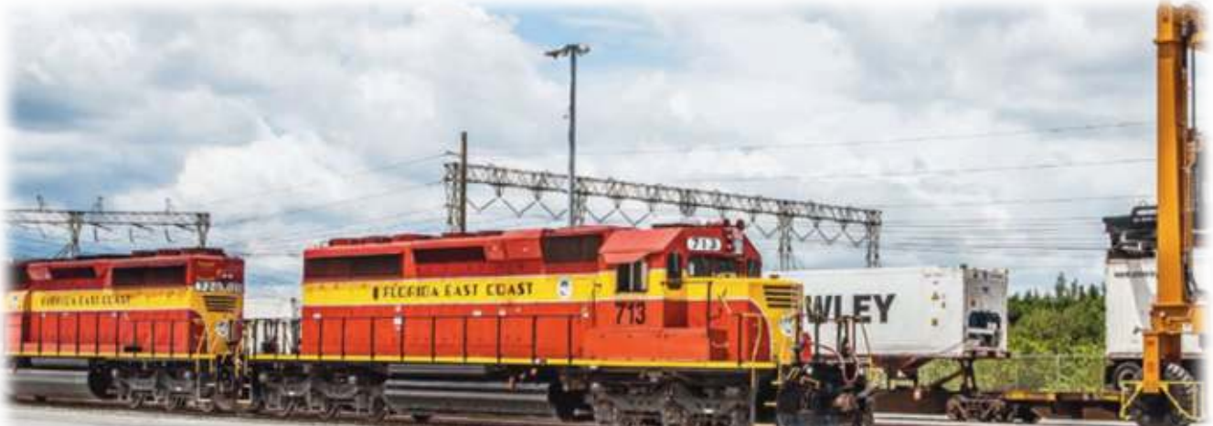
Florida East Coast Railway's Intermodal Container Transfer Facility is credited with increasing cargo volume at Port Everglades.

OBJECTIVE T4.6 Strengthen and foster regional collaboration and cooperation through coordinated planning, operations, and capital investment to ensure efficient freight transportation.