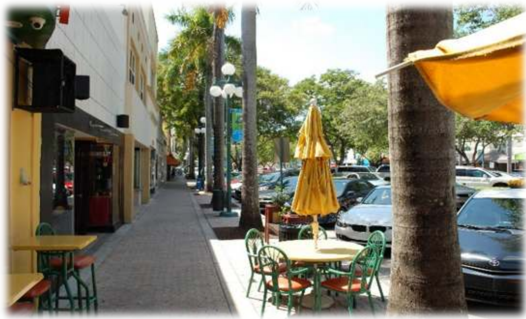
Example of a pedestrian-friendly environment that support Complete Streets Guidelines, Downtown Hollywood, described in Policy T1.1.5

POLICY T1.1.6 Broward County shall support and incorporate into the County's codes the utilization of context sensitive techniques to enhance bicycling safety and comfort, consistent with the Broward Complete Streets Guidelines, including, but not limited to: