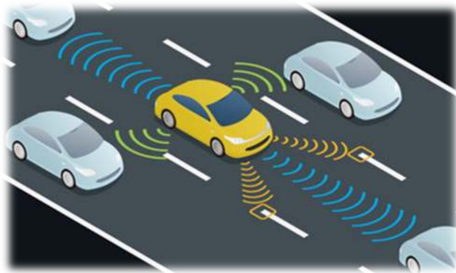
Automated/Self-Driving Vehicles are changing transportation planning. See Objective T2.7 and associated policies.

POLICY T2.7.5 Broward County shall examine best practices and methods for the safe and context sensitive implementation of shared mobility and micromobility solutions, such as dockless bicycle share, dockless scooters, and e-bikes.