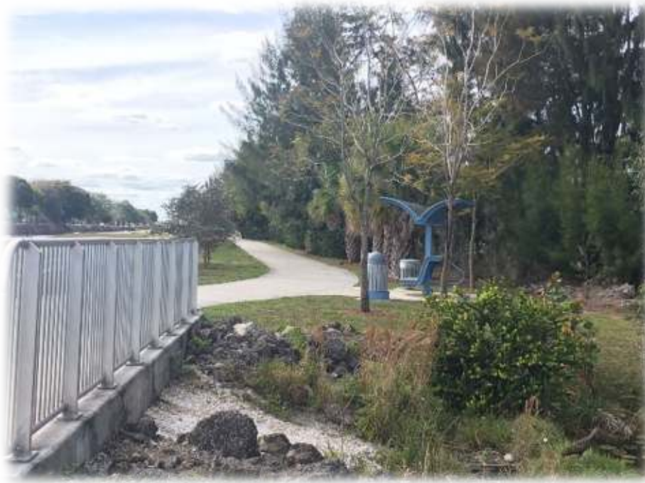
Broward County New River Greenway is an example of a project that supports Goal T1 and associated objectives and policies.

POLICY T1.3.8 Broward County shall update the Greenways System Master Plan no later than FY 2023.