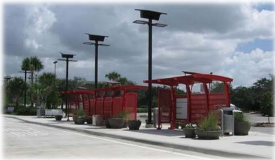
BB&T Center Park and Ride Lot for 95/595 Express Bus Service, an example of successful implementation of Policy T2.5.1

POLICY T2.5.2 Broward County shall provide for an energy efficient roadway network and work to reduce greenhouse gases through implementation of, but not limited to, the following programs, activities, or actions: