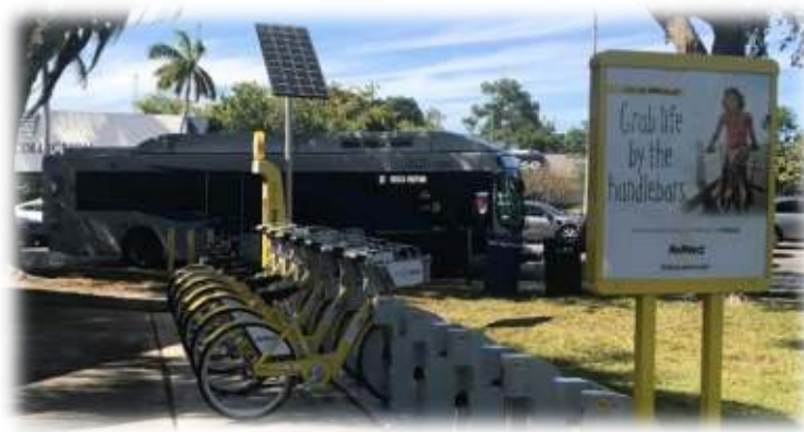
AvMed Rides by B-Cycle Station in Fort Lauderdale. More than 26,000 people have explored Broward cities by B-cycle since the service started, a program that supports Policy T2.5.1

Broward County's multimodal transportation system serves more than 1.9 million permanent residents in addition to seasonal residents, tourists, and commuters. Centrally located in Southeast Florida, the County recognizes that a regional approach is necessary to address transportation needs. Regional transportation systems in Broward, such as Tri-Rail, Florida State Highway System, and Florida Turnpike Enterprise System, are critical for regional commerce. Broward's Fort Lauderdale-Hollywood International Airport and Port Everglades extend the County's reach across the globe as a major gateway for tourism, freight, and business. Local pedestrian and bicycle networks link communities to transit, recreation, education, employment, and entertainment. Each mode of the transportation system is addressed in this Element to achieve an efficient, sustainable, safe, and convenient network integrated with land use and specific to the County's location within the region.