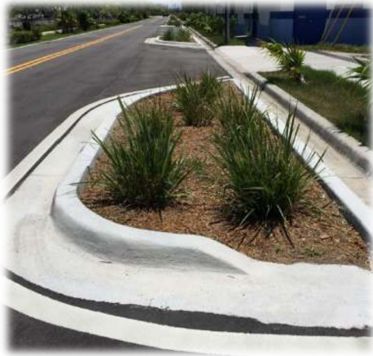
Flagler Drive Bioswale, Fort Lauderdale. Project that supports Policy T1.1.9.

POLICY T1.1.8 Broward County shall support and incorporate into the County’s codes and standards the context sensitive use of urban forestry techniques, including trees selected, located, and tended in a manner that assures healthy growth, to enhance pedestrian and bicyclist shade/cooling, and enhance corridor aesthetics.